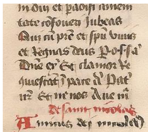
Segment of a page from a 15th century book of hours, from a private collection.

There are many illustrations of scribes in medieval manuscripts and they all convey an image of the simplicity of the scribe's kit. The quill pen was made from easily acquired materials and required only the simplest of equipment, basically a small sharp knife, in its manufacture. The quill and the knife were the all purpose kit for production and maintenance. And while the scribe might have to do regular running repairs, he never got a General Protection Fault. You can try this at home without creating hazard, but a lot of practice and patience might be needed to get a good result. Simple technology is like that.